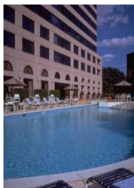
OMNI SOUTHPARK Austin, TX