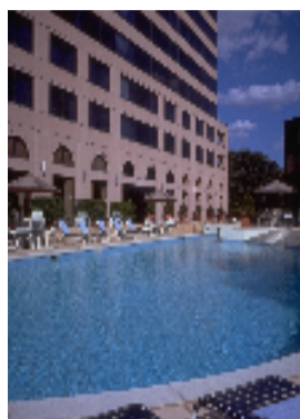
OMNI SOUTHPARK Austin, TX